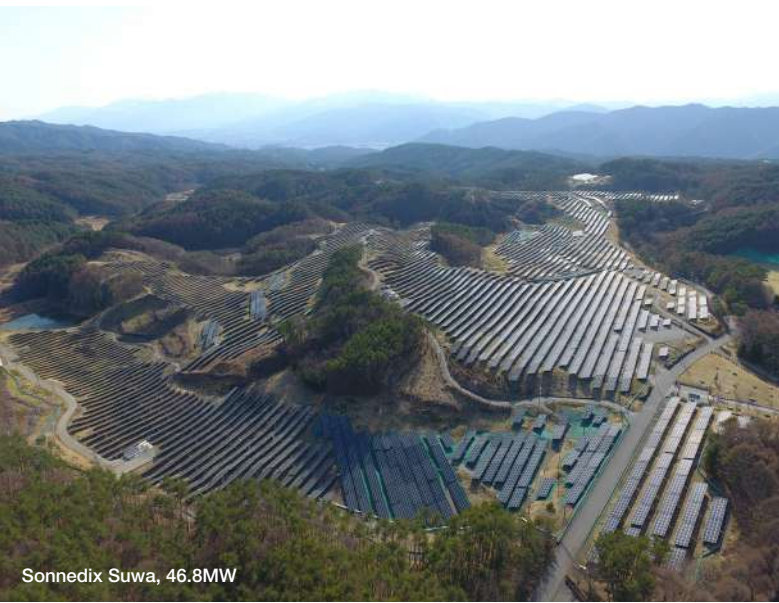
Sonnedix Suwa, 46.8MW