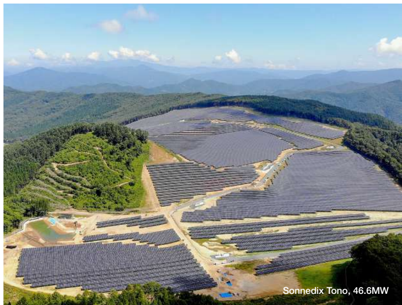
Sonnedix Tono, 46.6MW