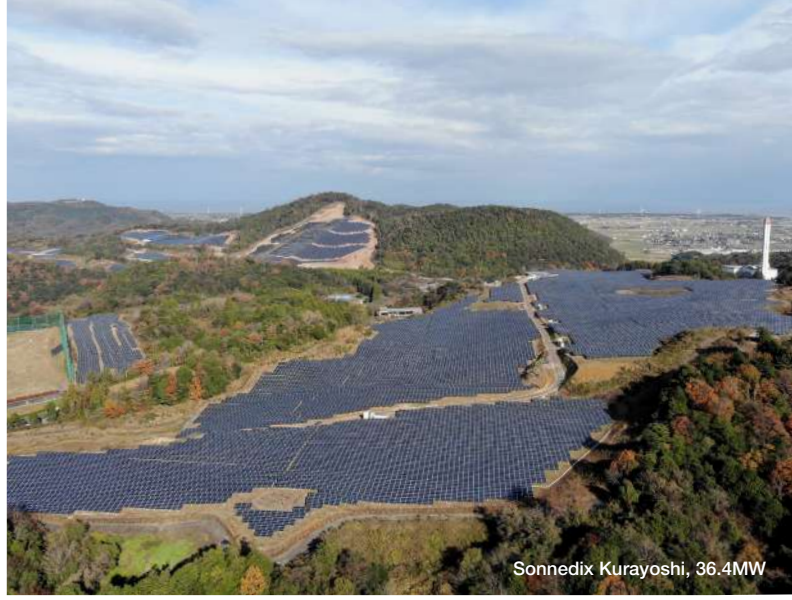
Sonnedix Kurayoshi, 36.4MW