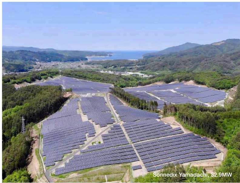
Sonnedix Yamadachi, 32.9MW