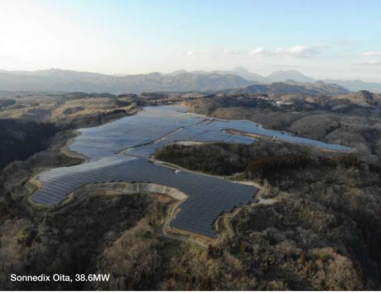
Sonnedix Oita, 38.6MW