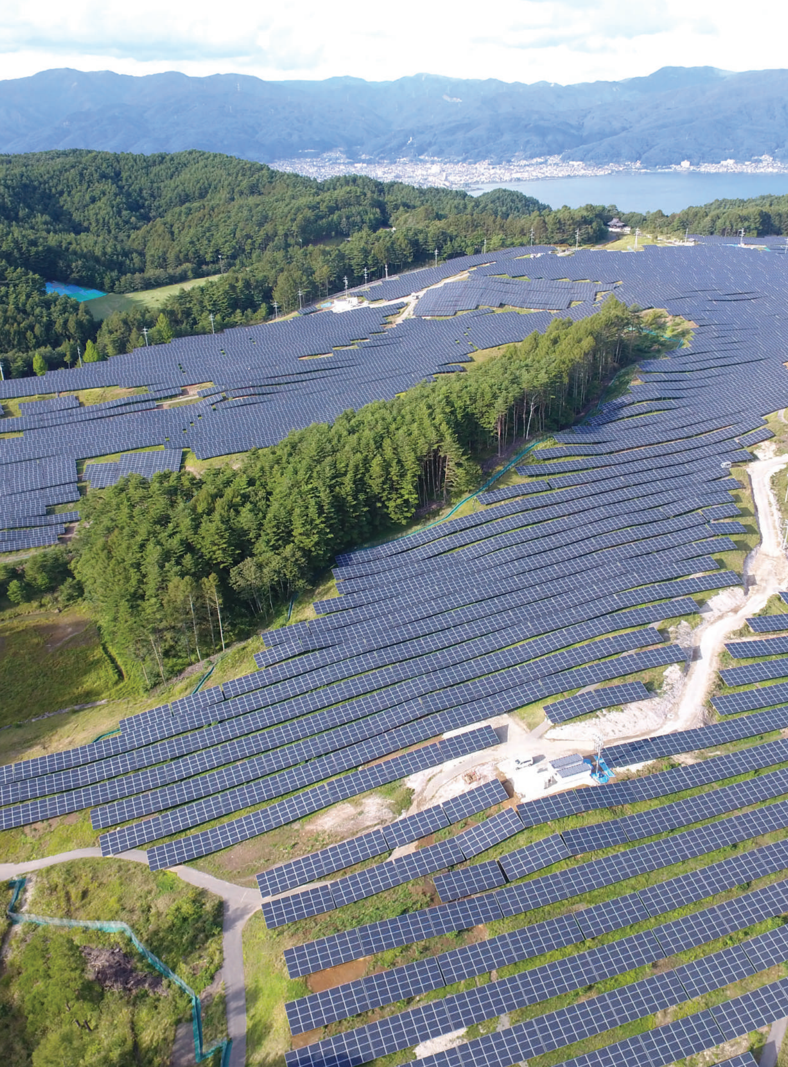
Sonnex Suwa, 46.8MW - Japan