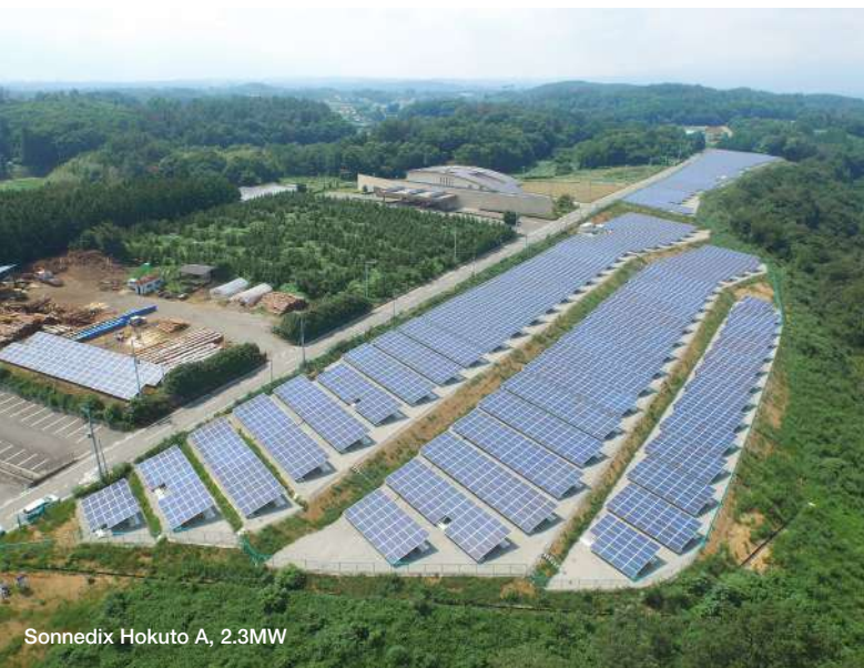
Sonnedix Hokuto A, 2.3MW